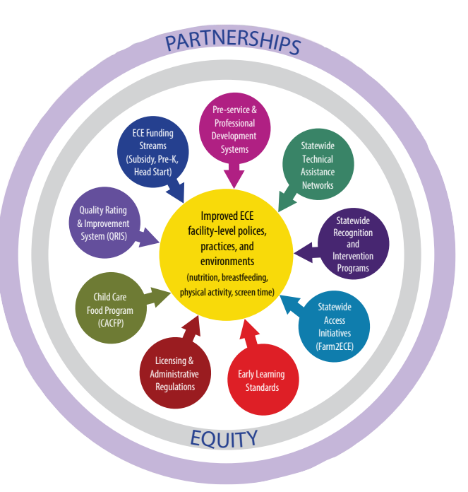
Figure 2: CDC Spectrum of Opportunities (2.0)

Child and Adult Care Food Program (CACFP)<sup>7</sup> – CACFP is a federal program that provides funding reimbursement for meals and snacks served to low-income children in ECE settings. Participating ECE programs follow CACFP standards regarding meal patterns and portions. Many