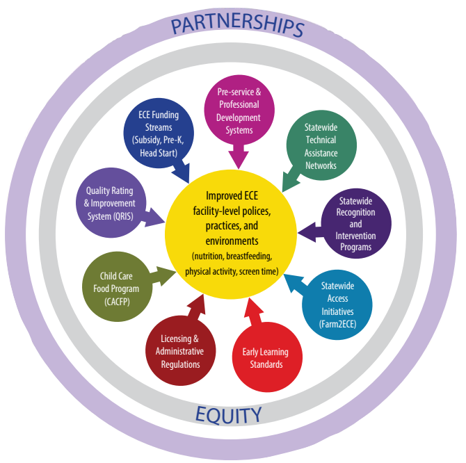
Figure 1: CDC Spectrum of Opportunities (2.0)

Many factors influenced how and when integration of best practice support into ECE systems was achieved. This case study series explores some of the integration opportunities pursued by each state/community, the outcomes of these efforts, and factors that may have hindered or enhanced their success. The uniqueness of each state or local ECE system (e.g., licensing, Quality Rating and Improvement Systems (QRIS), stakeholder groups) is described as an important contextual factor for integration activities.