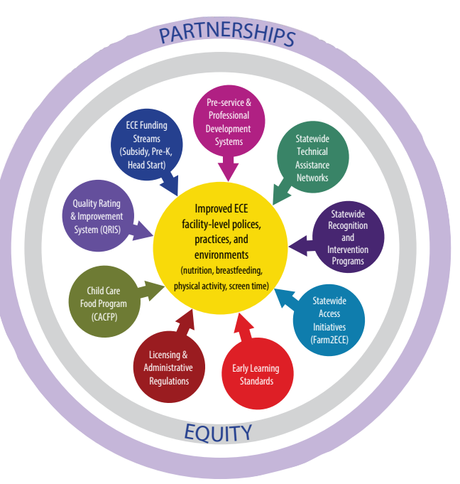
Figure 2: CDC Spectrum of Opportunities (2.0)

Child and Adult Care Food Program (CACFP) <sup>7</sup> – CACFP is a federal program that provides funding reimbursement for meals and snacks served to low-income children in ECE settings. Participating ECE programs follow CACFP standards regarding meal patterns and portions. Many states provide training or technical assistance to ECE