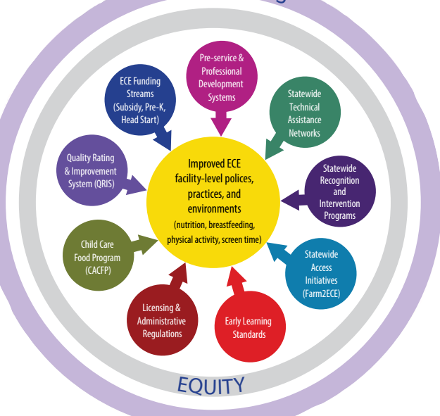
Figure 1: CDC Spectrum of Opportunities (2.0)